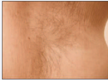
Axilla before Tx