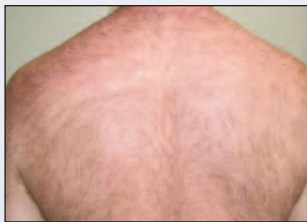
Full back before Tx

Editor’s Note: In the following clinical roundtable, practitioners who have established their experience with the new LightSheer Duet share their thoughts on how the system works, and what role this new device can play in today’s aesthetic practice.