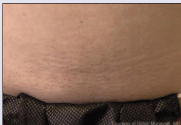
Lower abdomen eight months after six LightSheer Duet (HS hp) treatments