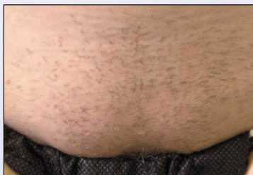
Lower abdomen before Tx