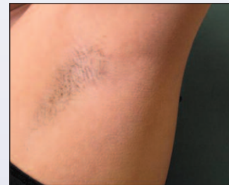
Axilla before Tx