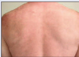
Full back after two LightSheer Duet (HS hp) treatments