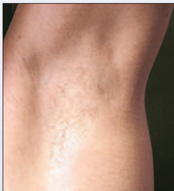
Axilla before Tx