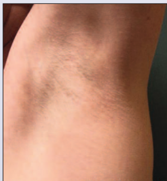
Axilla eight months after six LightSheer Duet (HS hp) treatments