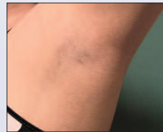
Axilla eight months after six LightSheer Duet (HS hp) treatments