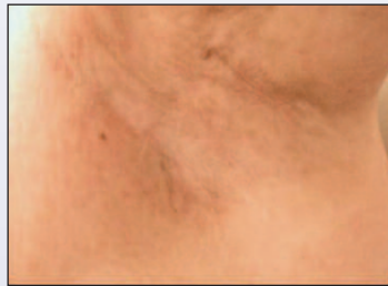
Axilla three months after five LightSheer Duet (HS hp) treatments